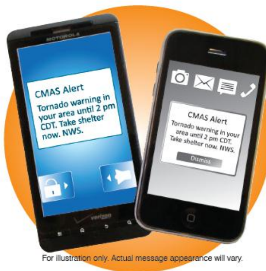
For illustration only. Actual message appearance will vary.

The alerts will tell you the type of warning, the affected area, and the duration. You'll need to turn to other sources, such as television or your NOAA All-Hazards radio, to get more detailed information about what is happening and what actions you should take.